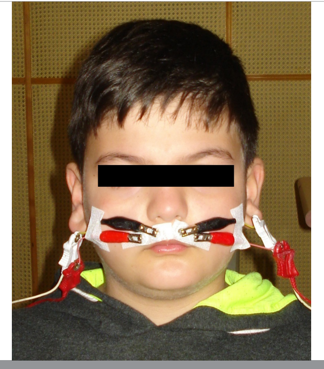
Figure 2. The orbicularis oris muscle electrodes

1. Physiological rest position : Subjects were asked to look forward after sitting and waiting without moving their jaws