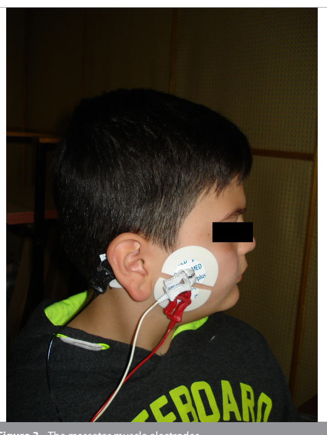
Figure 3. The masseter muscle electrodes

and/or teeth. After stabilizing the position, recordings were taken for 6 seconds for each muscle group.